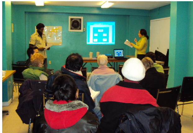
The first residents AI workshop

What exactly is Appreciative Inquiry? It's a theory, a learning/