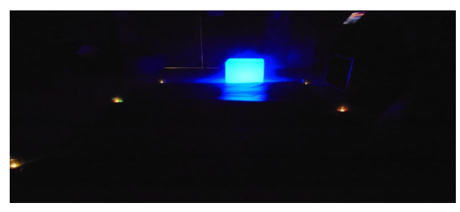
Multisensory Environment for families living with Autism

Monday's from 4:30pm-6pm November 6th -December 18th 2017 1911 Kennedy Rd, unit 105 Dorset Park Community Hub